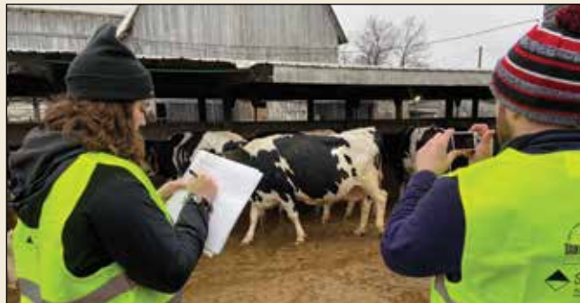
UW Dairy Challenge team members performing their on-farm assessment.